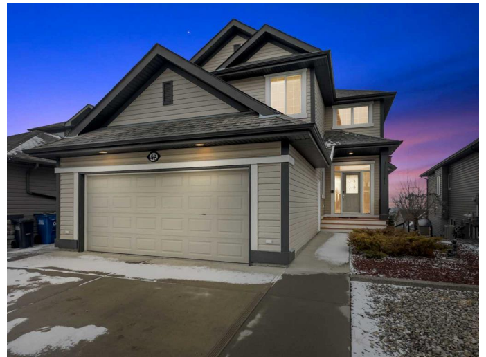
48 Sunset Ct, Cochrane, AB

Step inside to find a sun-filled interior, with large windows framing the breathtaking mountain vistas. Hardwood floors lead you from the welcoming foyer into the expansive living space, where the kitchen, dining, and living room flow seamlessly together. The gourmet kitchen features beautiful cabinetry, a large wrap around eat-up island that easily sits 8, granite countertops, stainless steel appliances, ample pantry space—perfect for both cooking and entertaining. Off the large kitchen dining, an patio space ideal for hosting barbecues, reading a book or simply enjoying the stunning mountain views, sunsets and nature at large. The cozy living room includes a gas fireplace, setting the tone for a warm