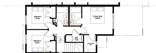
UNIT SQFT - UPPER 630sq ft