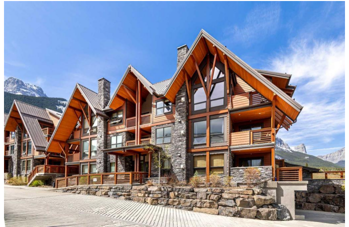
204C-2100 Stewart Creek Dr, Canmore, AB

Extend your living outdoors with a built-in BBQ, an expansive private deck, and seamless access to the surrounding trails. Whether it's morning coffee with a view or après-s-hike evenings with friends, this space invites you to fully embrace the Canmore lifestyle.